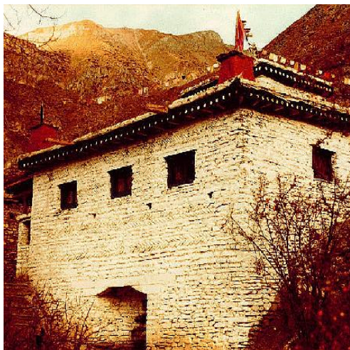
The "Temple Of Miraculous Fire" at Muktinath, Nepal. Photo by Ken Street (Nov. 1979).

[For more on this subject, please read our tract The Temple Of Miraculous Fire .]